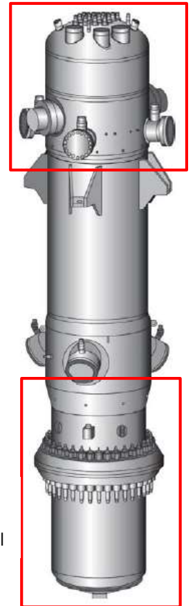
Representative model of NuScale Power Reactor Vessel