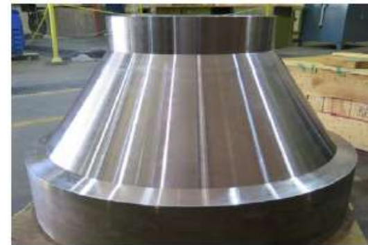
3700 lb BWR nozzle