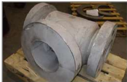
Large 316L SS Valve Body