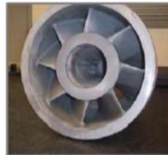
Steam Separator Inlet Swirler