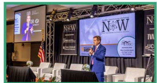
Elected Officials as Speakers