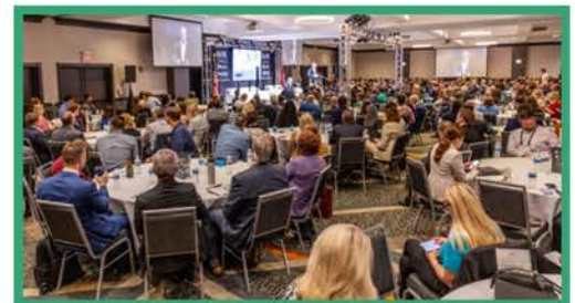
600+ Attended NOW 2024