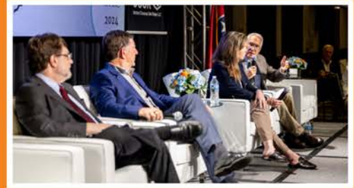
Fireside Chat with Experts

NOW features sessions that cover the business aspects of the nuclear industry as well as the technical side. This gives you and your company the opportunity to learn about both.