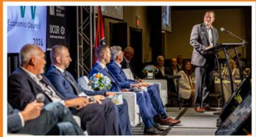
Nuclear Fuels Panel

NOW gives you opportunities to promote your company at different levels with inclusion in pre-event marketing, presence during the event in printed, digital, potential for social media, and on-screen materials as well as exhibition space. Post-event marketing is also a benefit with emails to attendees, and your logo on the ETEC website until next year's conference promotion.