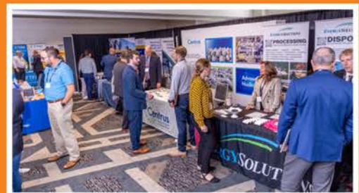
50+ Exhibit Booths in 2024

NOW offers a unique environment where you can engage with experts from Tennessee Valley Authority, the U.S. Department of Energy, and its M&O contractors and their subcontractors, as well as a diverse array of small and large private-industry companies showcasing projects and technological capabilities. This includes interaction with students, interns, and postdocs as part of our efforts to grow the future workforce in Tennessee.