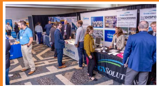
50+ Exhibit Booths in 2024

NOW offers a unique environment where you can engage with experts from Tennessee Valley Authority, the U.S. Department of Energy, and its M&O contractors and their subcontractors, as well as a diverse array of small and large private-industry companies showcasing projects and technological capabilities. This includes interaction with students, interns, and postdocs as part of our efforts to grow the future workforce in Tennessee.