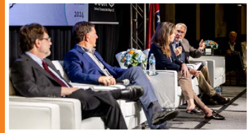
Fireside Chat with Experts

NOW features sessions that cover the business aspects of the nuclear industry as well as the technical side. This gives you and your company the opportunity to learn about both.