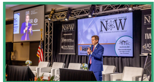
Elected Officials as Speakers