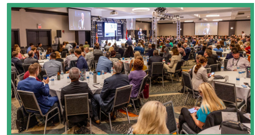
600+ Attended NOW 2024