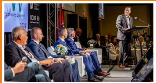
Nuclear Fuels Panel

NOW gives you opportunities to promote your company at different levels with inclusion in pre-event marketing, presence during the event in printed, digital, potential for social media, and on-screen materials as well as exhibition space. Post-event marketing is also a benefit with emails to attendees, and your logo on the ETEC website until next year's conference promotion.